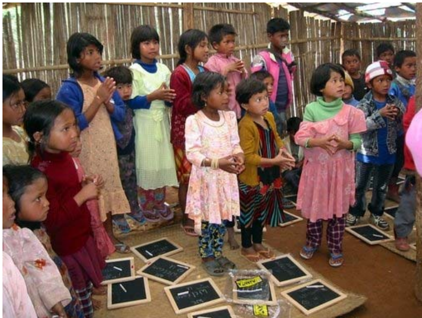
Children at a typical Khasi village school