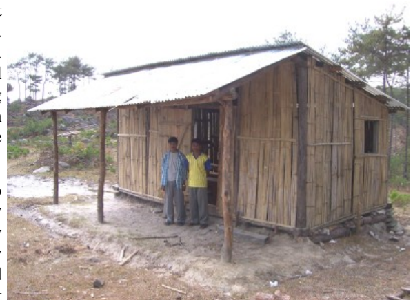
The school and teachers in Kut

** Stay tuned for next month's article where we will answer specific questions about a UUS partner church relationship with Kut.